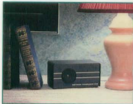
Industrial strength for the home as well.

The Transonic Cix is a heavy duty unit that is designed to withstand years of use. The galvanized steel case covered with an epoxy paint makes the unit virtually indestructible.